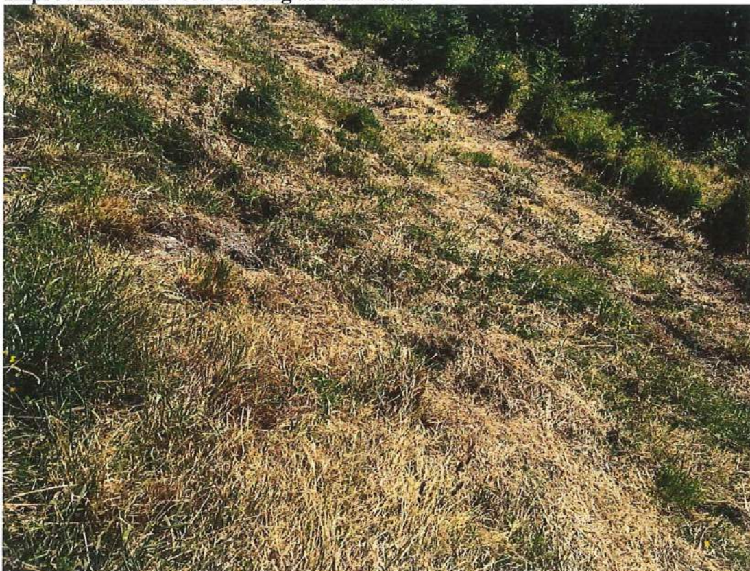
No movement in slump on bund