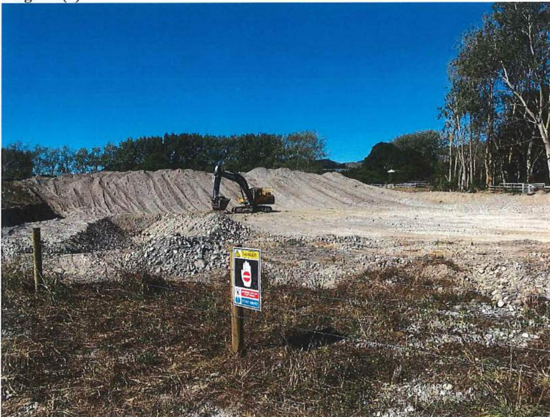
Return on noise bund at northern end of Stage 1B(b)