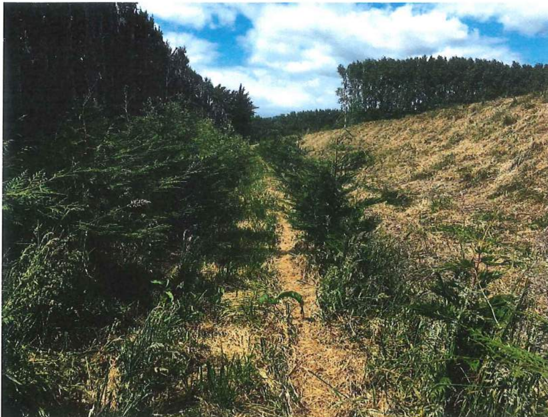
Improvement on weed clearing around trees