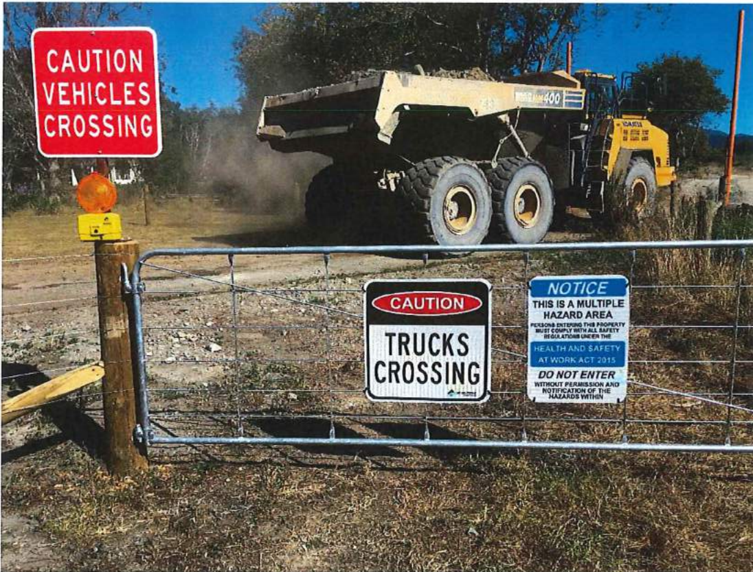
Vehicles crossing paper road