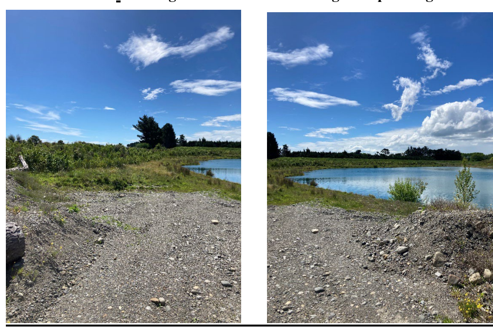
Looking to the west towards stage one planting.

Stage two acoustic bund constructed and shaped ready for planting.